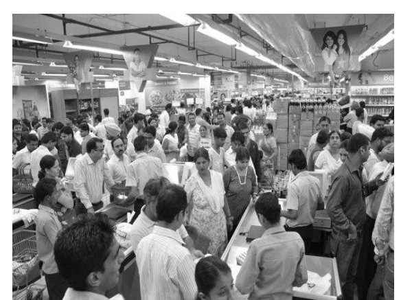
Fig-it shows the big queue of people waiting at the billing counter. In super market